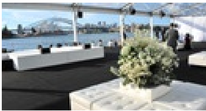
WELCOME TO SYDNEY GARDEN PARTY