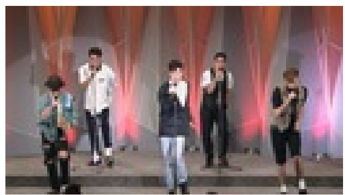
TALENTED CHILD SINGERS