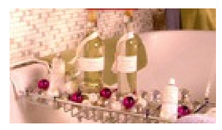
OPRAH'S PAST FAVORITE THINGS - $25-$50